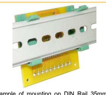
Example of mounting on DIN Rail 35mm.